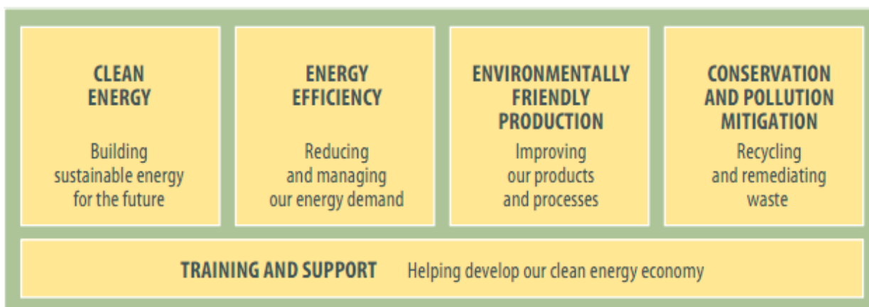
Figure 1: The Categories of the Clean Energy Economy

While the definitions and categories outlined above allow for considerable overlap, their design and description captures a basic reality of the clean energy economy—it is in the early stages of development and literally changes and expands with every new invested dollar. The categories and definitions will lend themselves to the evolution of the clean energy economy, and capture and categorize new technologies, businesses and jobs as they are developed going forward. Please see Figure 1, for a graphical representation of the five categories. 2